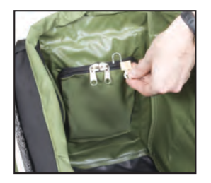
Lockable Pocket (inside backpack) with padlock and key.