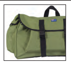
3 x External Pockets